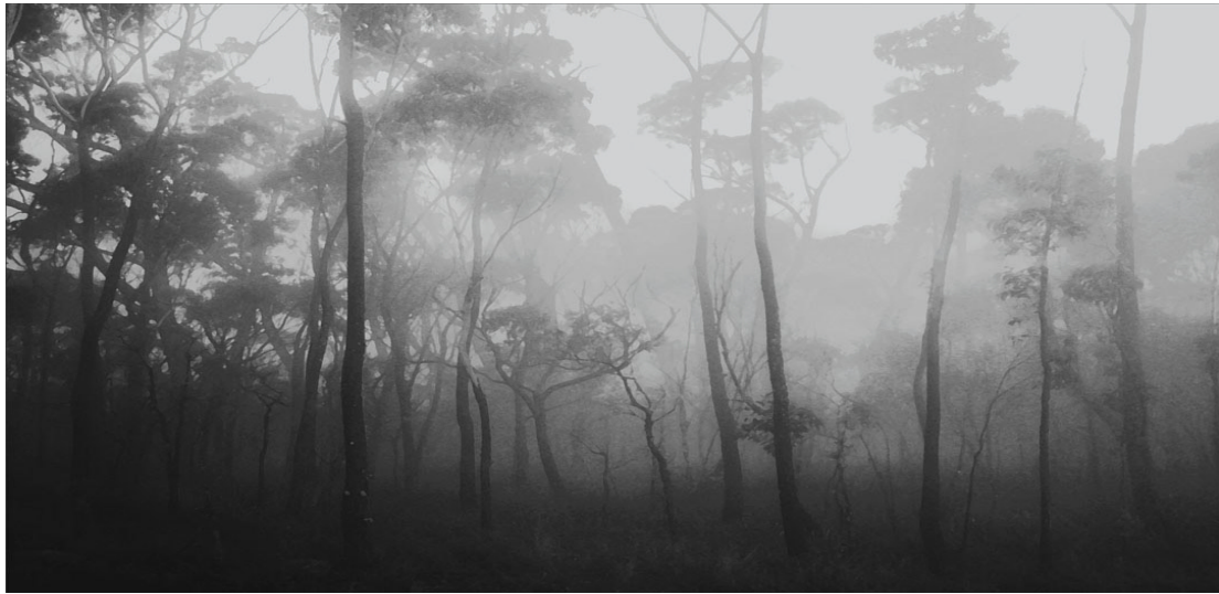
"Into the Mystic 3"